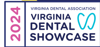
Exhibit Hall Map